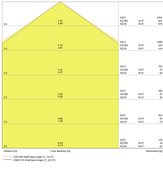
LDC typ cone